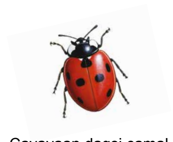
Cayayaan daqsi camal oo balaal adag