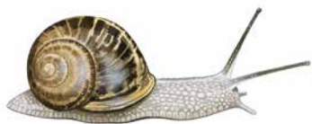
Dixiri kholof leh