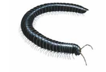
Dixiri lugo badan leh