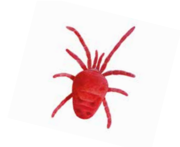
Red spider mite